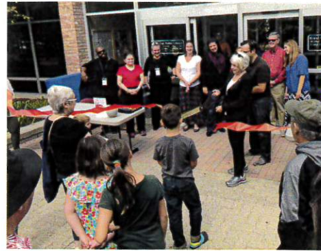
Ribbon-cutting ceremony for ROPL Sunday hours.