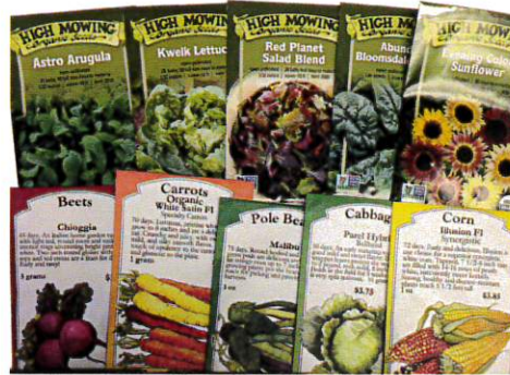
Samples of available seeds in ROPL's Seed Library.