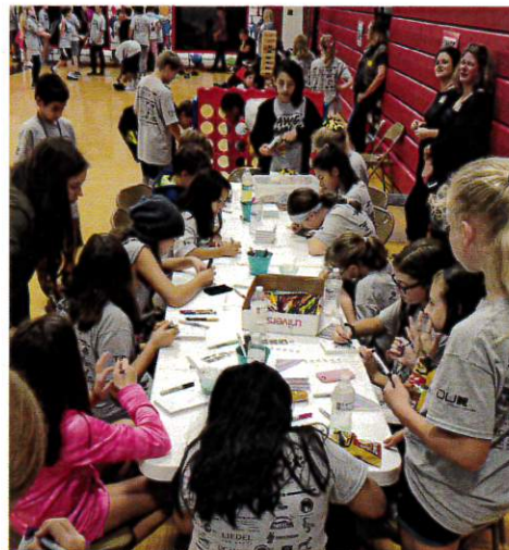
ROPL outreach at ROMS Dawg Walk.