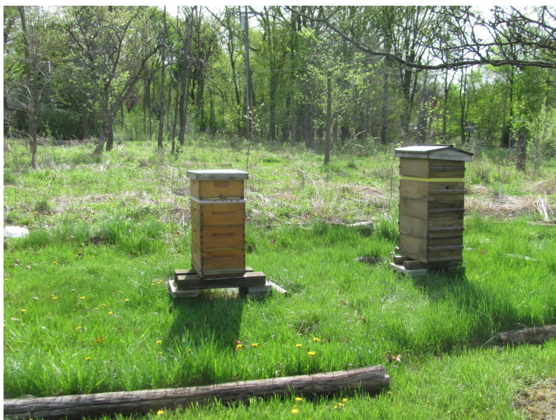
Our new bee colony located in the arboretum