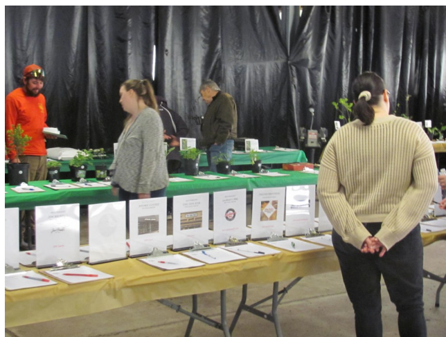
Our guests checking out our auction items in 2024

Firefly Forest School JD's Yard Men Kal's Lunch Bowl Lakeshore Tree Preservation New Species CrossFit Royal Oak Historical Society Tree First Arboriculture Troop 1629